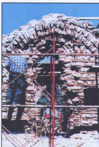
Fig. 4. St. Nikolas in Pili.

It is located very close to the western shore of Small Prespa. It belongs to the triconch type. Though at a first glance the building appears to be very symmetrical, symmetry does not exist. The church was covered with a dome with a drum, which was destroyed during the second world - war. Masonry has rich tile decoration, with horizontal brick courses and vertical bricks, which surround the stones, while further brick ornamentation makes the whole unique in the area. Lime mortar of very good quality was used, which still keeps its stiffness. Traces of frescoes indicate that it was painted all over.