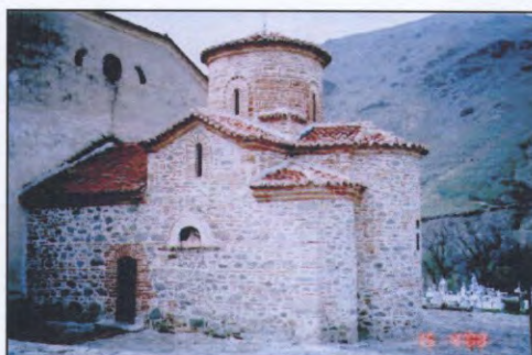
Figure 3. St. Germanos.

Built at the beginning of the 11 th c. St. Germanos is a cross – inscribed church with a dome rested on four massive pillars. There are three layers of frescoes. The oldest was painted at the beginning of the 11 th c. and it probably coincides with the building of the church, the second is from the 12 th or the beginning of the 13 th c., while the last layer was painted in 1743, according to an inscription. Today the church is covered with frescoes of 1743, while traces of the others can be seen at certain parts of the walls. Architectural, iconographic and excavating observations indicate that the monument has undergone different alteration and renovation during the course of its existence. Most obvious were the changing of its entrance, the building of a three aisled basilica in touch to its western façade in 1882, the plastering of the other three facades in 1950s, and the covering of the floor with cement. Furthermore, bibliographic research and old photographs indicated that underneath the plaster interesting masonry was preserved with tile decoration and, yet, the height of the external walls and the roofs was increased.