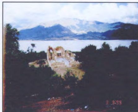
Figure 2. St. Achillius.

The church, preserved in ruins, is exceptionally large. (Fig. 2) It was fully excavated in 1960s by prof. N. Moutsopoulos. All ground plan has been saved and permits understanding the whole arrangement and typology of the building, its function and its construction. The coins found during the excavation in Basilica prove that the church functioned until the middle of the 15 th c.