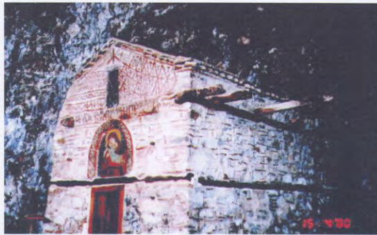
Fig. 5. Hermitage of Panayia Eleousa.

Limited repair works were carried out to Panayia Eleousa, especially to consolidate the southwest part of foundation, while more extended were the works to Metamorfosi, including interventions to masonry and roof. Furthermore, the cells were repaired and the environmental space was improved. Frescoes were partly cleaned and consolidated and archaeological research was made to Metamorfosis to reveal the initial size and form of it.